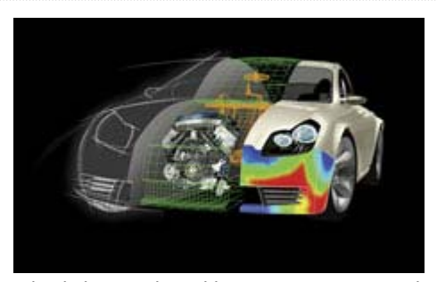
Automotive simulations such as this one can save car makers a lot of money.

Injection-molding simulations are invaluable to car makers, Autodesk's Martin says. Injection molding is a process for producing parts from plastic materials. Simulations show whether an injection mold -- such as a bumper, for instance -- will cause denting and how the mold will fit with other parts of the car. They also reveal any defects. Designers consider many variables: the temperature of the mold, its geometric shape and how the injection-mold process will work with certain materials.