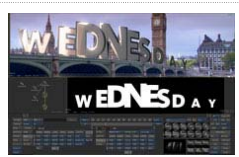
Special-effects tools like Autodesk's Smoke Text Preset, which created the 3D movie title above, run on the desktop.

There are possibilities for discovering new trends among social networks or identifying their key influencers. Recommendations could be made for improving the energy efficiency of behaviors such as traffic routing to avoid congestion, scheduling computer applications to minimize energy usage, and monitoring a smart power grid, Bader says.